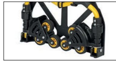
SXWTD-FT584: Stair Climber Wheels