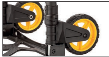
SXWTD-FT582: Comes fully assembled