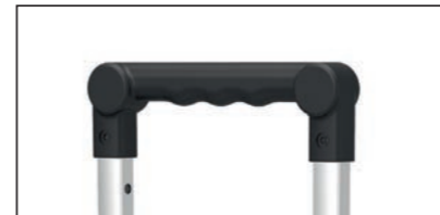
FXWT-705: Soft Grip Handle

FXWT-707: Adjustable handles offer knuckle protection and fold in for compact storage.