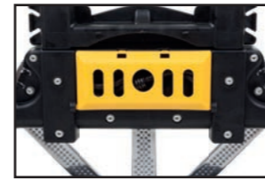
SXWTD-FT500: Bungee Storage

SXWTD-FT501: Fully compatible with SXWTD-FT505 Folding Utility Basket.