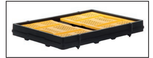
SXWTD-FT505: Folds Flat