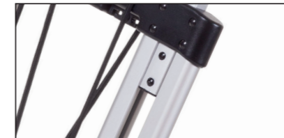
FXWT-706: Double Tube Frame