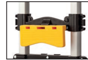
SXWTD-FT501: Crate Holding Clip