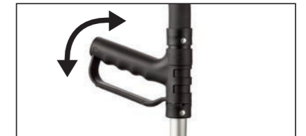
FXWT-707: Adjustable Grip