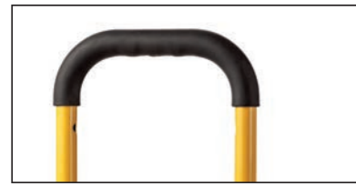
SXWTD-FT580: Soft Grip Handle

SXWTD-FT584: The wheels make sure it is easy to maneuver on stairs, thresholds, curbstones and other obstacles.